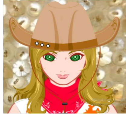
Figure 1. Some of the avatars students used