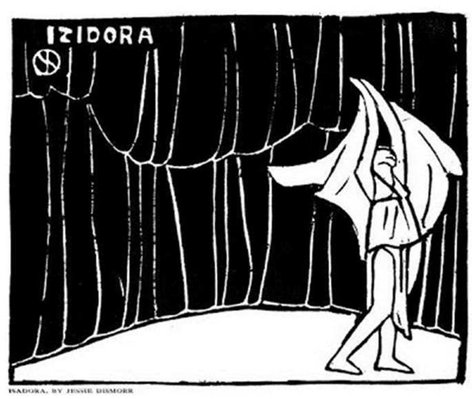
Figure 4. Izidora by Jessica Dismorr (1911).

From the intertextual aspect, another aesthetic analogy depicting women's liberation is Dismorr's Izidora , <sup>15</sup> a 1911 illustration published in Rhythm . In this work, Dismorr portrays Isadora Duncan, an American dancer and a pioneer of modern expressive dance, whose performances helped to free ballet from its conventional restrictions. The image depicts modern dance with liberated rhythms by alternating black and white colours, as reproduced in Figure 4: