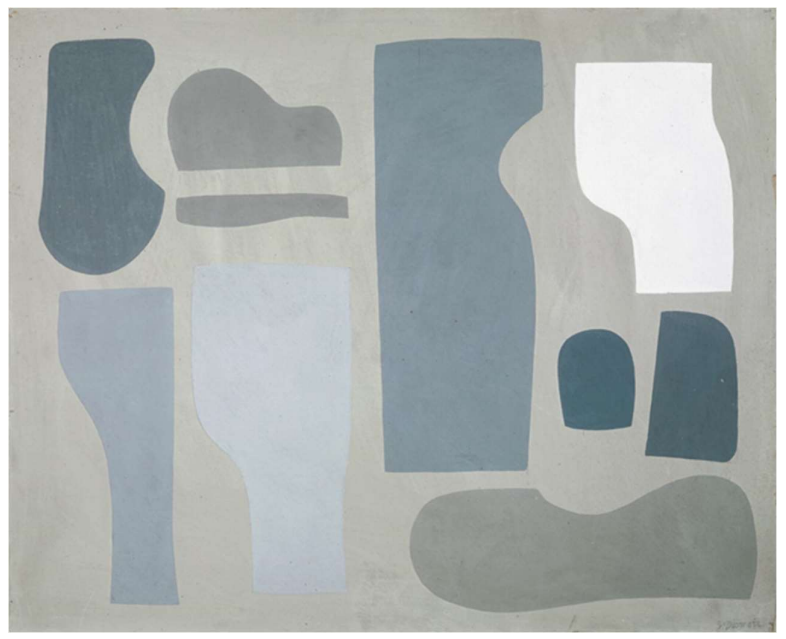
Figure 3. Related Forms by Jessica Dismorr (1937).

In her later abstract painting Related Forms , the pastel-coloured geometric forms are illustrated in different shapes as if they are completing one another, reproduced in Figure 3: